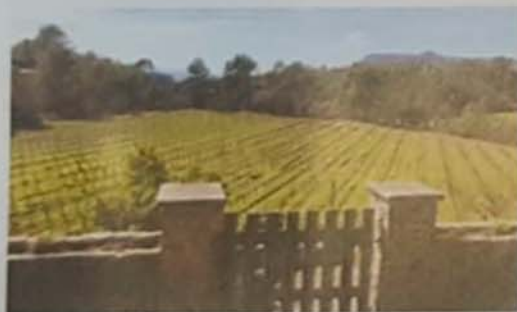
A view over the vineyards of the DOP Pla de Bages